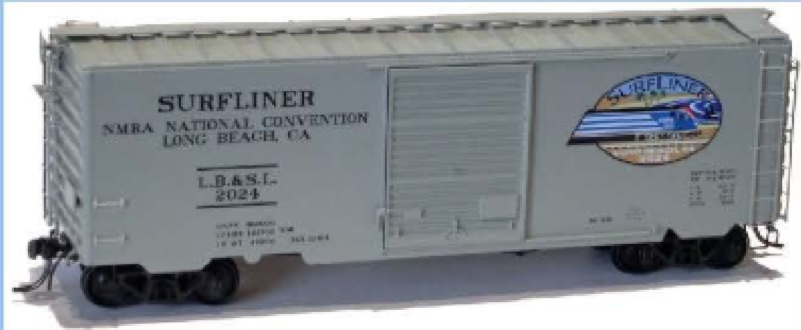
HO Surfliner Car

HO and N Scale SurfLiner convention cars are still available! They can be yours for $15.00 each (originally sold for $30 at the convention). Each purchase includes a SurfLiner convention pin. Please contact Vic Cavalli for information: director@ladiv-nmra.org