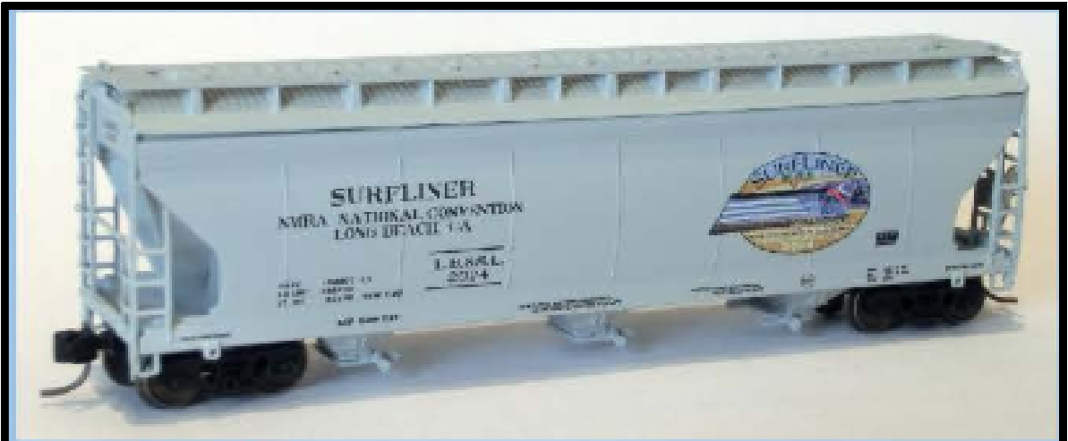
N Surfliner Car