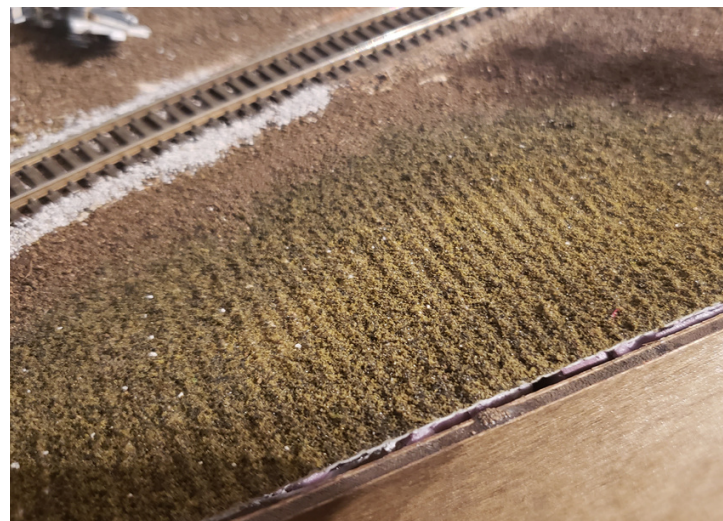
The furrows before crops are planted

The base is made with corrugated styrene, (from Plastruct), that convincingly replicates irrigation furrows approximately 12-15" in width, cut to the shape of my field. I then spray both sides of the piece a dark black or brown. This will be useful if the ground cover chips off in the future. Once dry, I coat one side with a spray adhesive, and cover it with a liberal coating of ground cover. This will act as the soil, so any dark color will work. I used Woodland Scenics fine turf "Earth" mixed with "Soil". Once this was dry, I shook off the extra turf and reapplied as necessary. After I was happy with the coverage, I glued the plastic field to the layout. At this point, it looks like a field in between plantings.