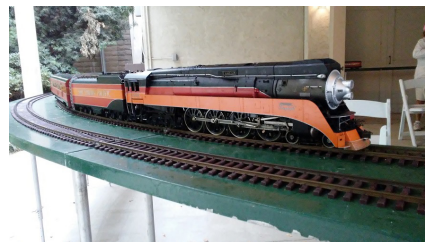
The live steam Daylight is always a crowd pleaser.