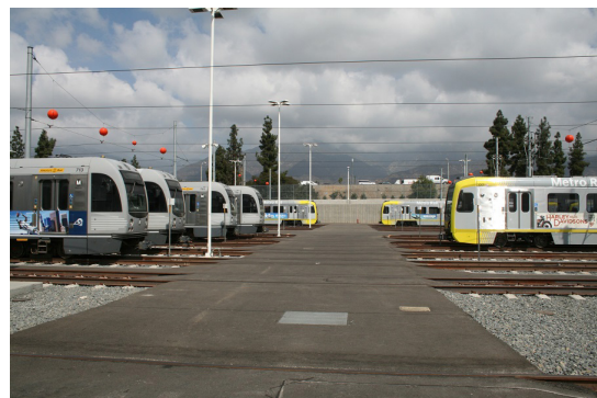
The Metrorail facility tour was amazing.