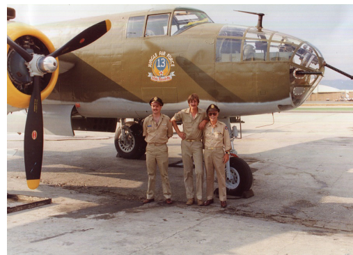
Here I am with the B-25 I worked on. I am the scruffy looking guy in the middle.