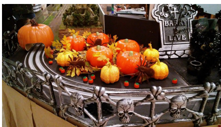
Halloween themed layouts make this event fun for kids.

So it was a very busy weekend for both young and old with plenty of trains running. Beautiful things to see in the Gardens itself. A great weekend for all.