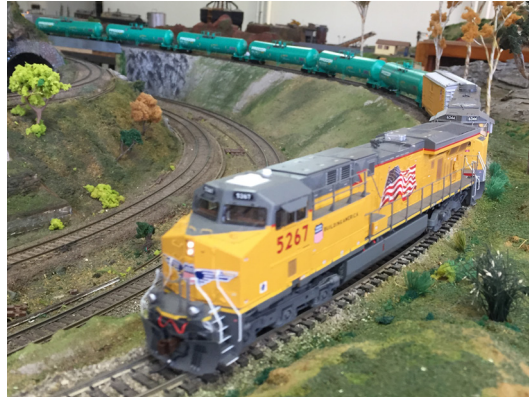
UP on the AMF.