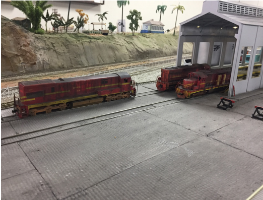
AMF RFFSA locomotives.