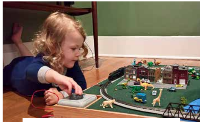
The new railroad is approximately 30" x 32"

I put this together during one of his naps. A piece of scrap plywood, trimmed with 1" oak, and some 1/2" pink insulation foam, make up the base. A grass mat provides the surface, and some blue craft foam was used for the river. While the layout downstairs is DCC, this one uses an old Bachmann DC throttle and EZ-Track I had on hand. The track isn't attached, so we can change it if we'd like. The buildings were from prior layouts and currently unused, as were most of the trains he runs. Because we already owned the trains and structures, I think I spent less than $50 on materials. Of course, these aren't his only trains. He has some Brio, some Thomas Trains, some battery powered plastic ones, and all the train magazines and books he could ever need. But this little railroad is different.