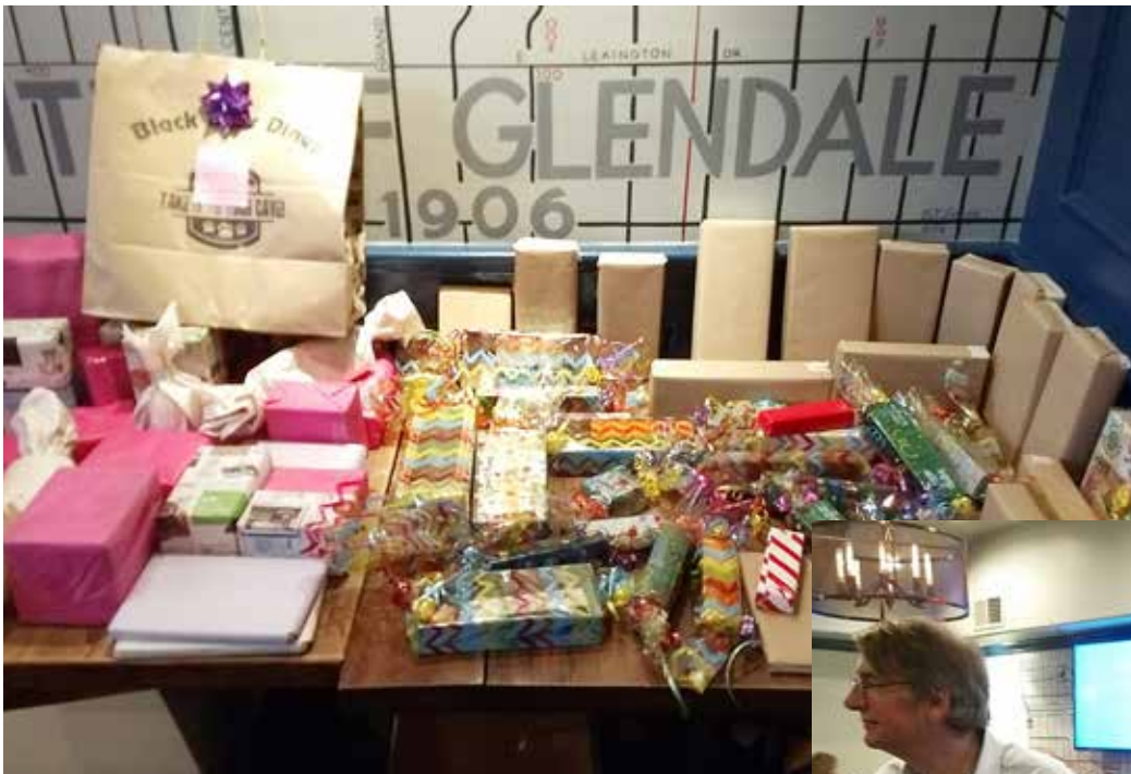
Gift table of assorted goodies for all those attending.