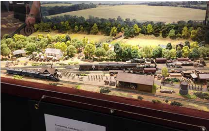
A very scenic Civil War Display.