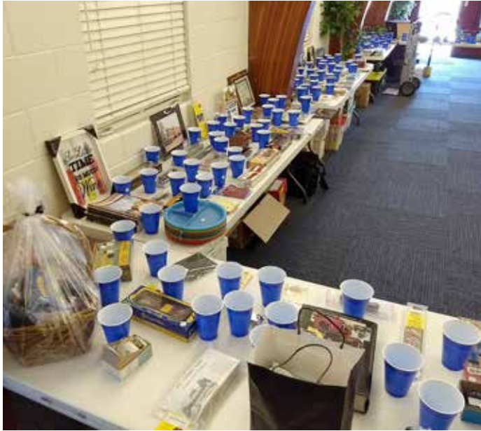
The nearly endless selection of blue cups and incredible item up for auction. Literally something for everyone!