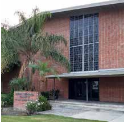
The 1st Annual LA Area Prototype Modelers Meet (LAAPM) was held Oct 6 at Encounter Church in Bellflower, CA.