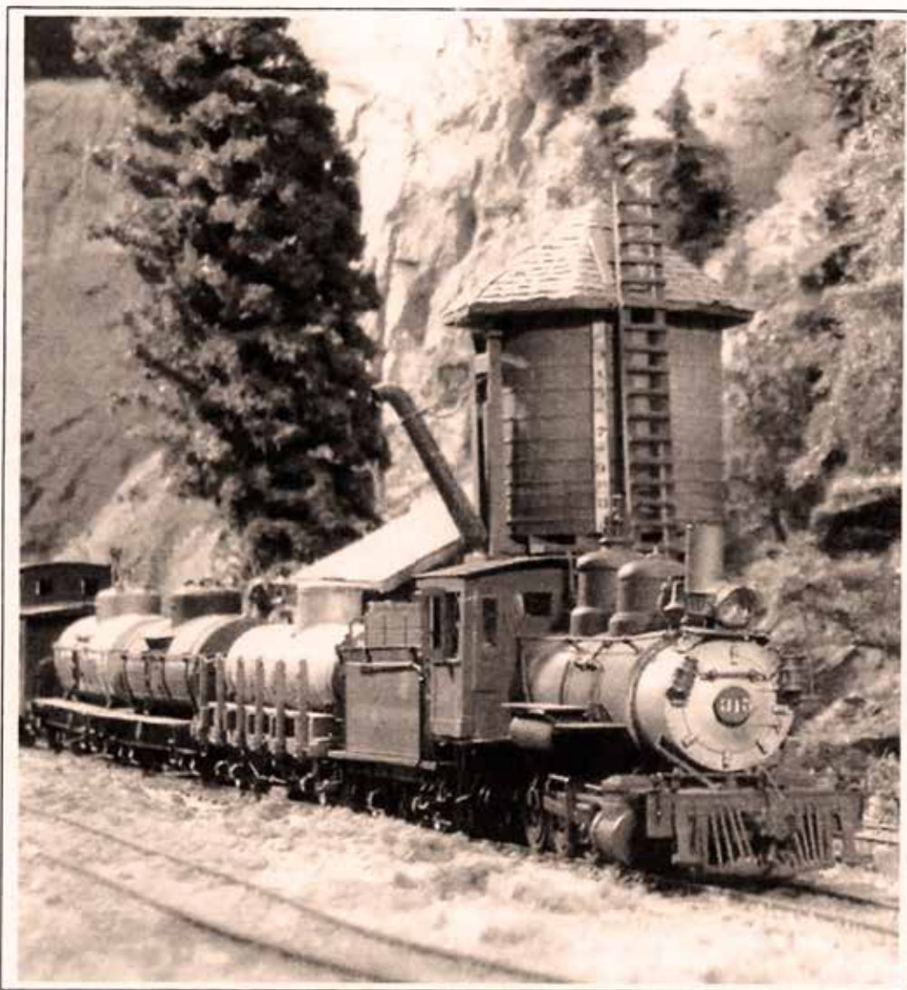
D&RGW #315 pulls tank cars into the main at Johnsen's Mill on Slim Gauge Guild's Sn3 layout.