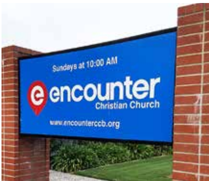
The event was sponsored by RailMaster Hobbies and Co-Sponsored by LA Division NMRA. Attendance was about 150 modelers showing off the models that they have built.